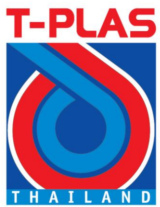
International Trade Fair for the Plastics and Rubber Industries

With plastics becoming more indispensable in automotive engineering and with an upward trend towards Electric Vehicles (EV), the Thai government's