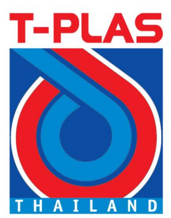
International Trade Fair for the Plastics and Rubber Industries

With plastics recycling evolving rapidly from a niche to a trend, driven by legislative targets for plastics recycling that many countries around the world have enacted – increasingly the circular economy is playing a very central role. A key feature at T-PLAS 2023 is a focus on plastics recycling and sustainability – a platform where visitors can connect